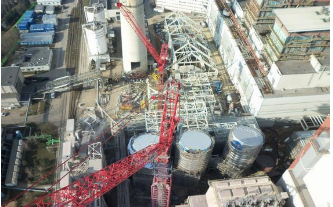
Construction of structure of the prism storage facility and gypsum dehydration equipment