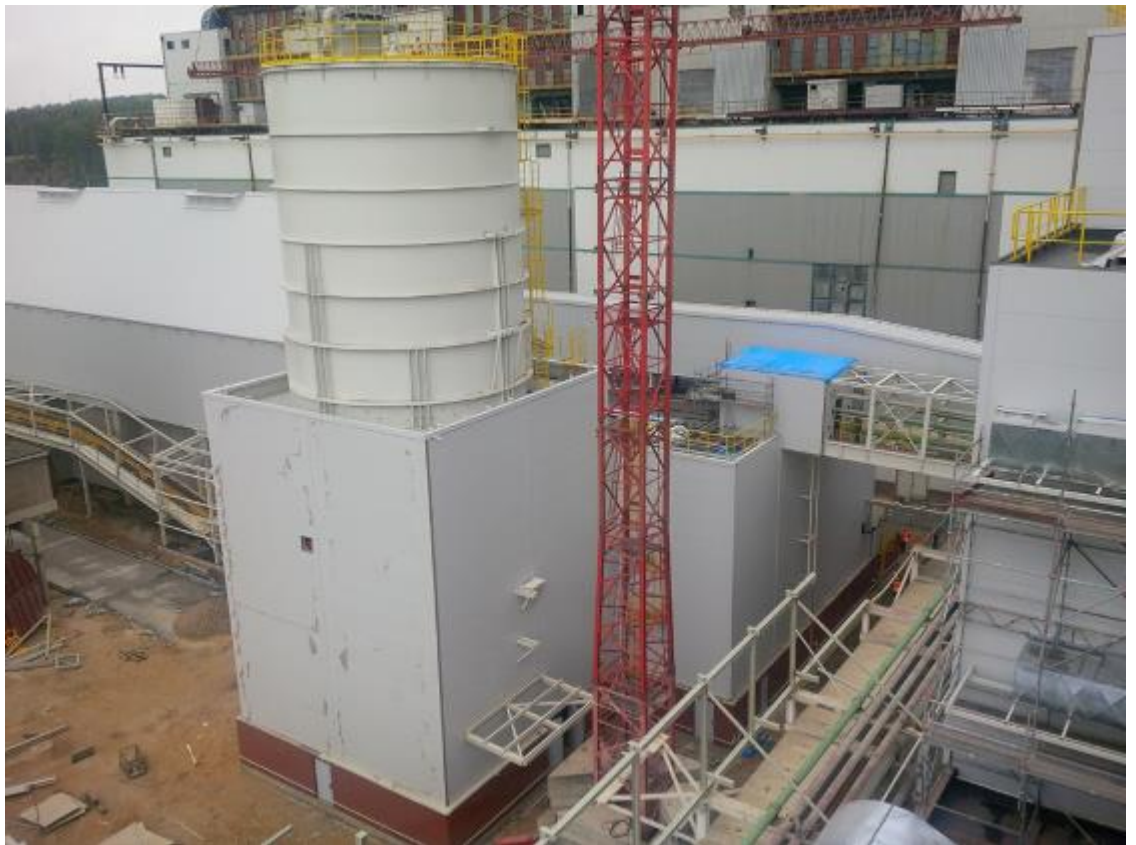
Construction of the wastewater treatment system