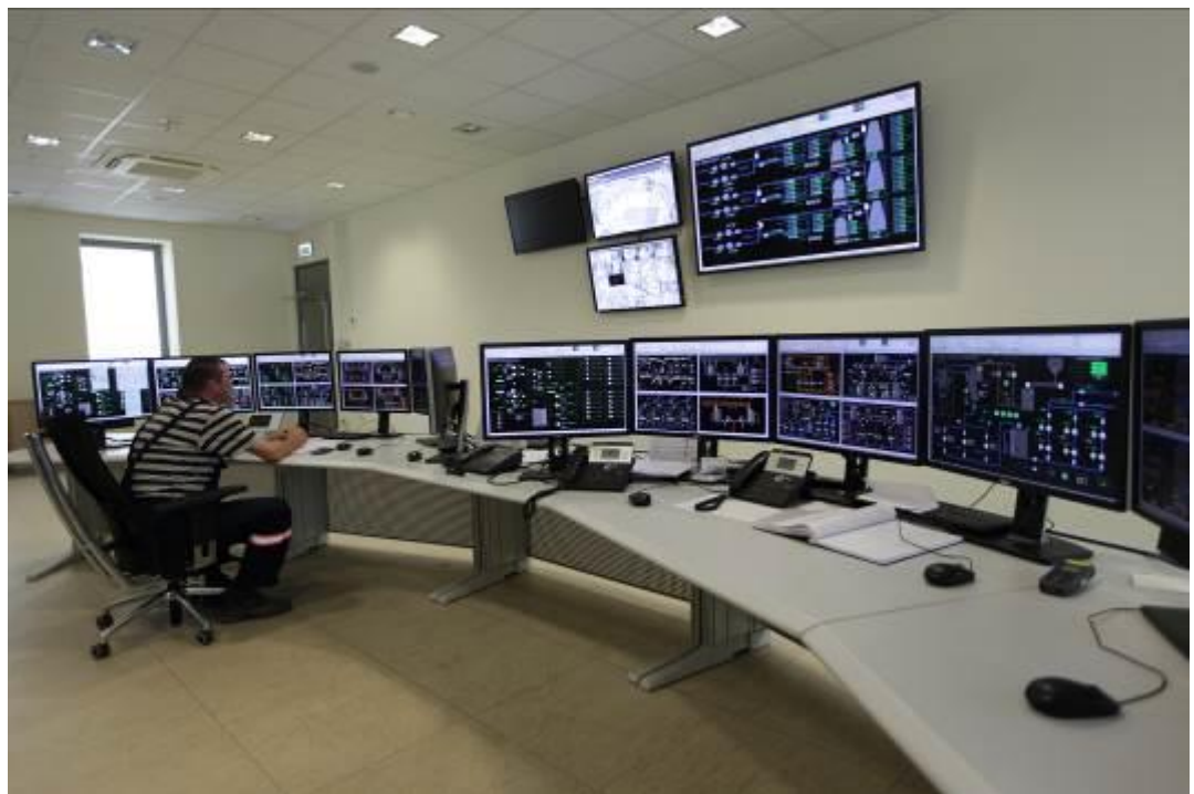
Control room of the wet flue gas desulphurisation system