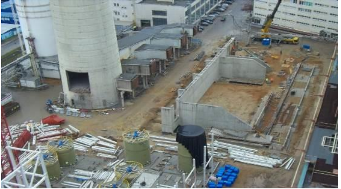
Construction of foundations for the prism storage facility