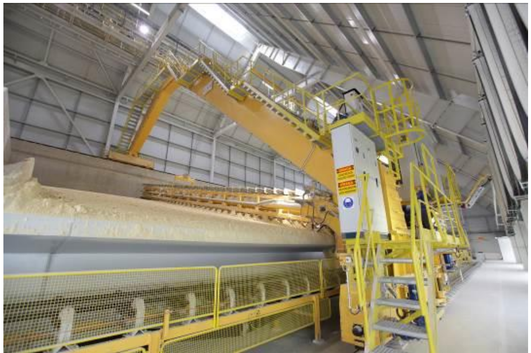
Prism storage facility