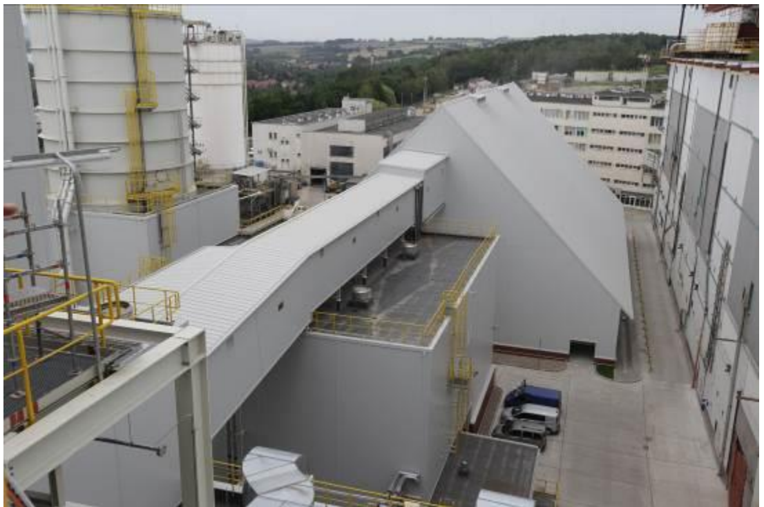
Wastewater treatment building and prism storage facility