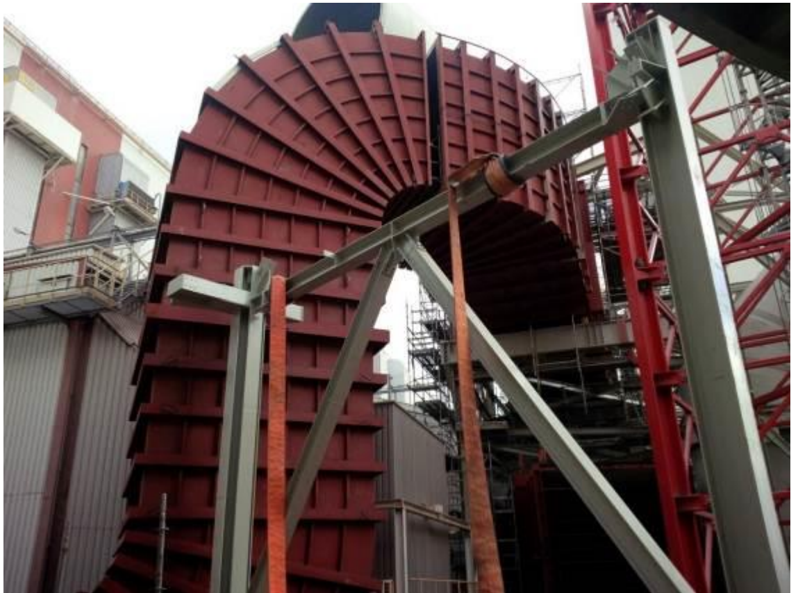
Construction works, supply/modernisation, assembly and start-up of flue gas fan for unit no. 6