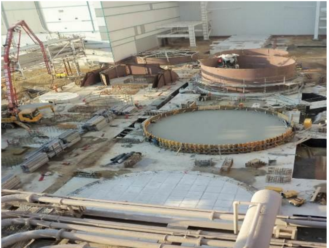
Construction of foundations for absorbers, pump stations and other facilities