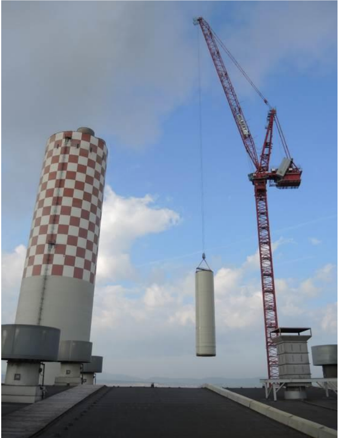
Adaptation of the last six-conduit chimney draught